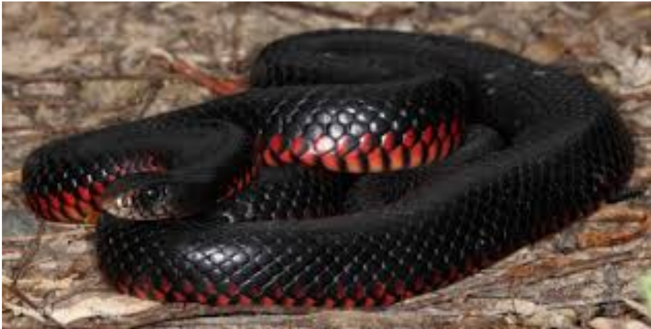
red belly black snake