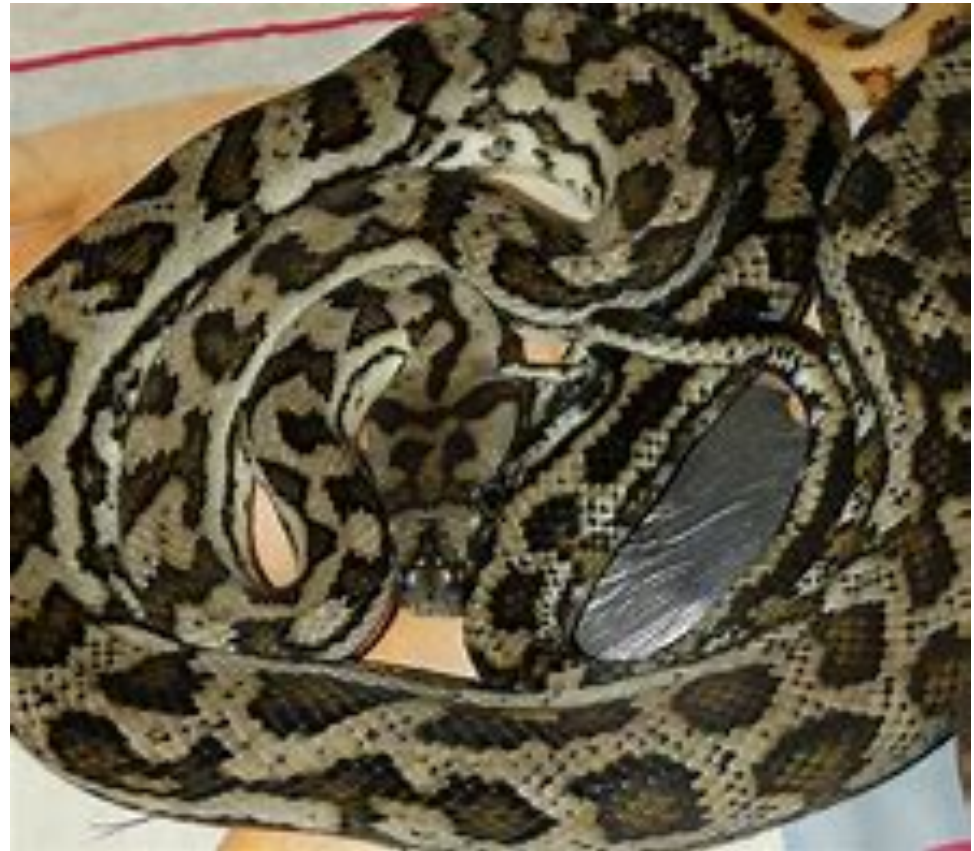
carpet snake (ancestral spirit messenger)