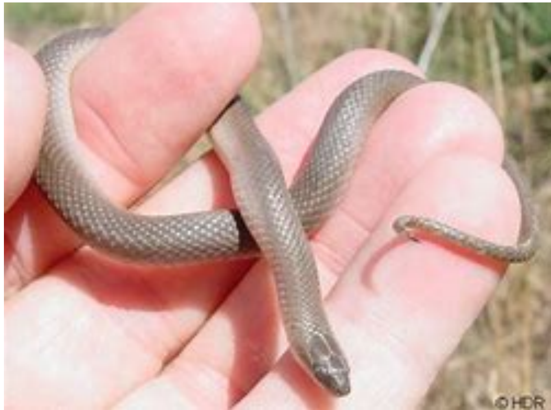
Small grey snake