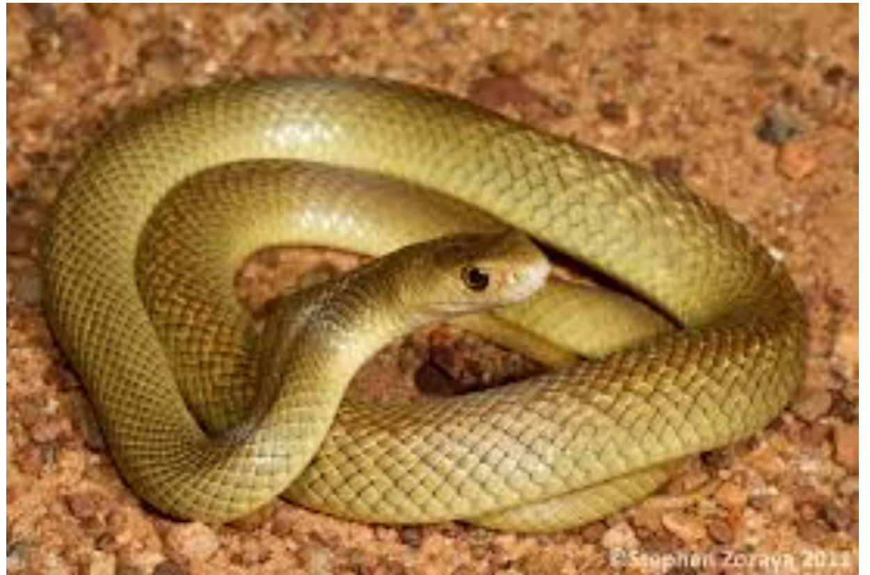
Yellow (coloured) Eastern Brown