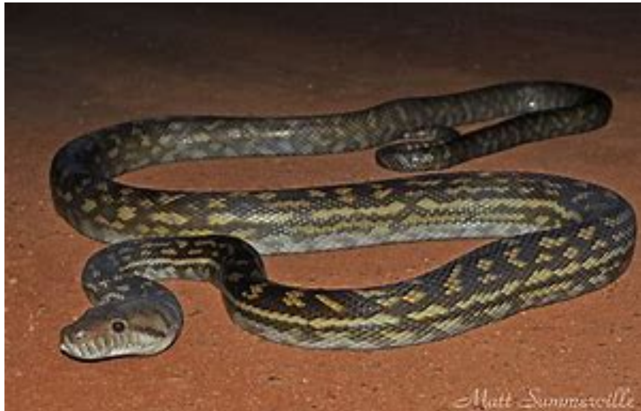
spotted scrub snake