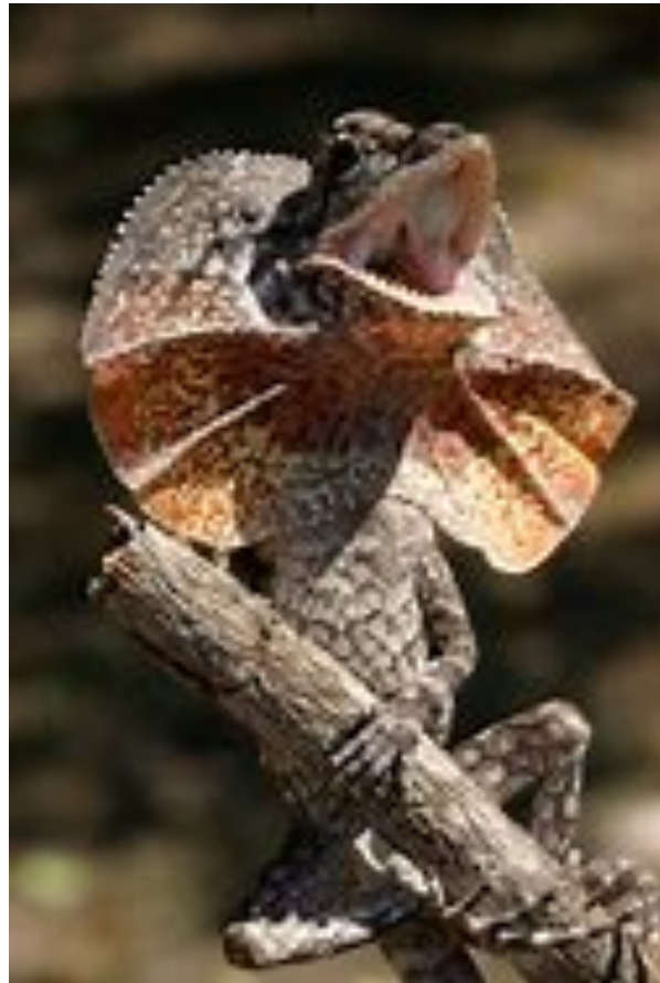
frilled neck lizard