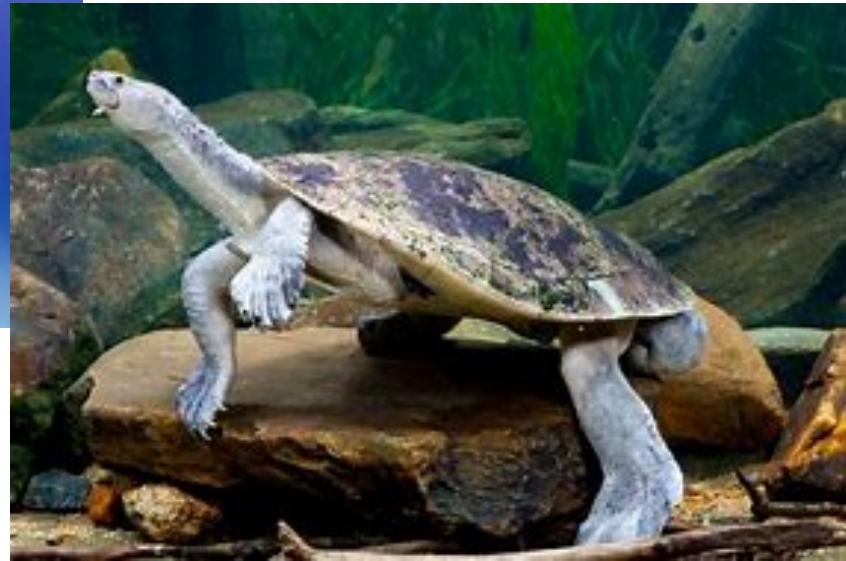
Turtle, ocean and river