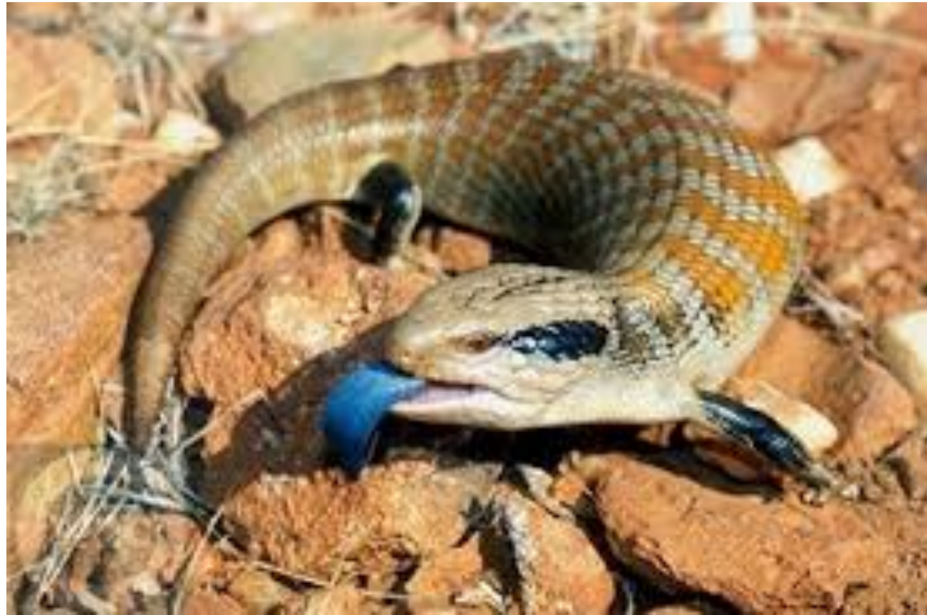
Blue tongued lizard